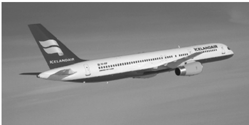
On the way to Iceland

The new open skies agreement grants designated airlines in both our countries permission to fly to any destination