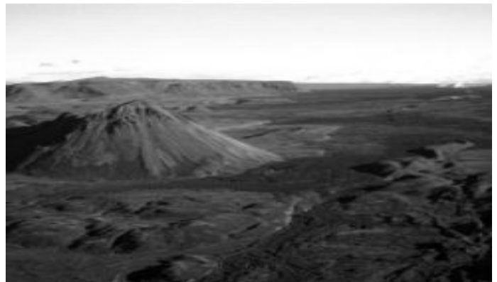
Krafla, a volcanic mountain in north-east Iceland

Hearing my name being said with a thick Icelandic accent. Tasting the sweet warmth of freshly home cooked pönnukökurs. Holding a handful of dried up lava bits at the Krafla. Sniffing out tiny black flies at Myvatn as they tickled the inside of my nostrils.