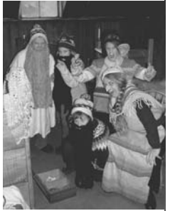
Grýla and the Yulelads would not miss an event like this.