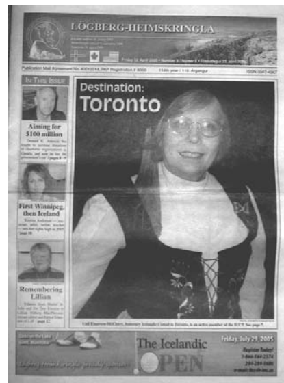
A recent front page of Lögberg-Heimskringla , which had Toronto as a focus point.