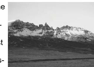
Hraun in Öxnadalur

The annual ICCT travel show will be held at the Scandinavian Center, 91 Stormont (Bathurst/Lawrence). As usual the Travel Show will feature slide shows, traveling stories and all necessary information about Iceland and how best to get there. This is a great opportunity for everybody to get information and ask the questions that they always wanted to ask