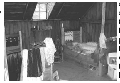
The Badstofa replica was a huge success