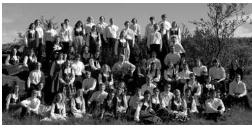
The Hamrahlid choir