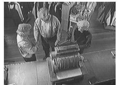
A scene from "Saga of Hope"