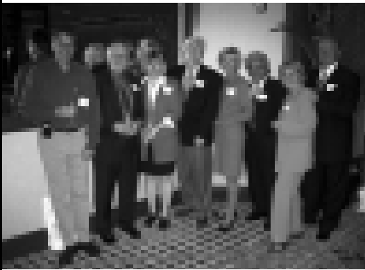
Consular members of the Icelandic Canadian Chamber of Commerce