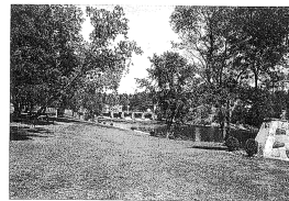
Kinmount town park (1995) along the Rural Route. The route commemorates the local apparel industry. Icelandic Canadian Club of Toronto