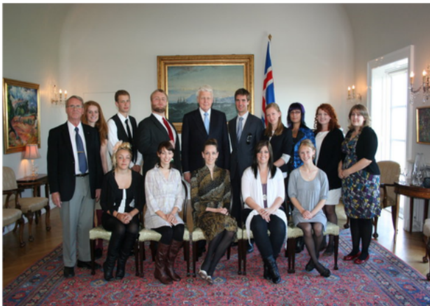
Snorri 2010 group at the President's residence.

FRIDAY NOV. 23 rd @ Bier Markt Esplanade 7:30 – 9:30 p.m.